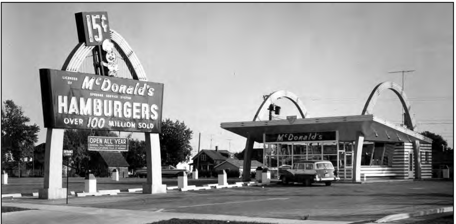
McDonald's on the north side of Sheboygan — 2307 North Avenue

Believing the McDonalds' formula was sure to succeed, Kroc dreamed of franchises throughout the country. The brothers were skeptical, but Kroc offered to take the reins and the risk for setting up the new stores. A partnership was formed. Kroc's first restaurant opened on April 15, 1955, in Des Plaines, Illinois, but he eventually bought out the brothers.