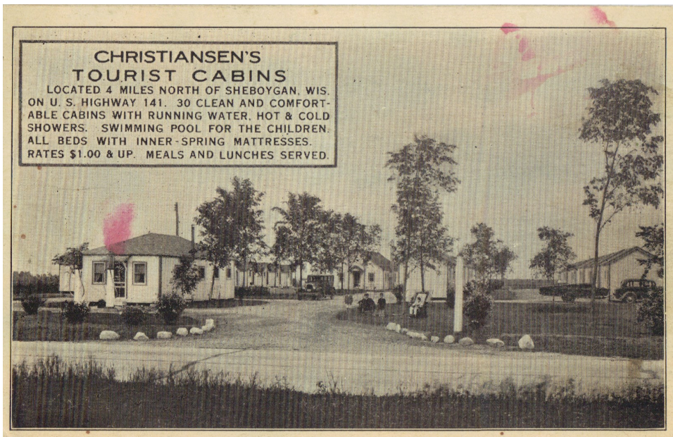
Christiansen's Tourist Cabins 4 miles north of Sheboygan on Hwy 141.

free automobile camps located strategically alongside new stores and restaurants. The camps boasted washrooms, running water, and picnic tables. Competition was fierce between neighboring campgrounds, which numbered around 300 in the state in 1923.