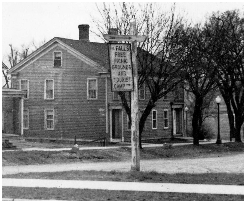
Notice the sign in Sheboygan Falls giving direction to the Free Picnic Grounds and Tourist Camp. The sign was located on the southwest corner of Monroe and Water Streets, the building that is today the Research Center can be seen in the background.