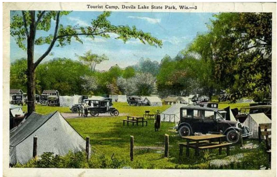
Tourist Camp at Devil's Lake, Wisconsin postcard.

Are we there yet? That's a question every parent hates to hear when on a road trip. It may well have been one of the more popular phrases heard on Wisconsin roadways during the 1920s when travel by car became a family event.