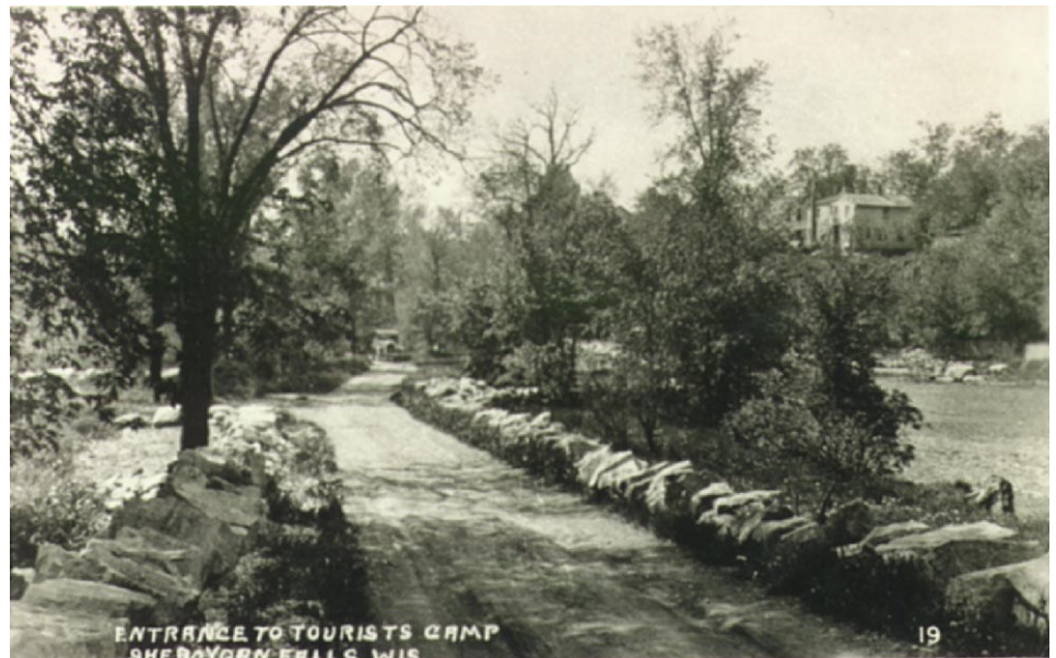
Entrance to Sheboygan Falls Tourist Camp located on the east side of the river in the flats near today's Rochester Park, the camp was finished and ready for business in 1923.

Though the camps and cabins have disappeared, they certainly were an essential part of Sheboygan County's early tourism business.