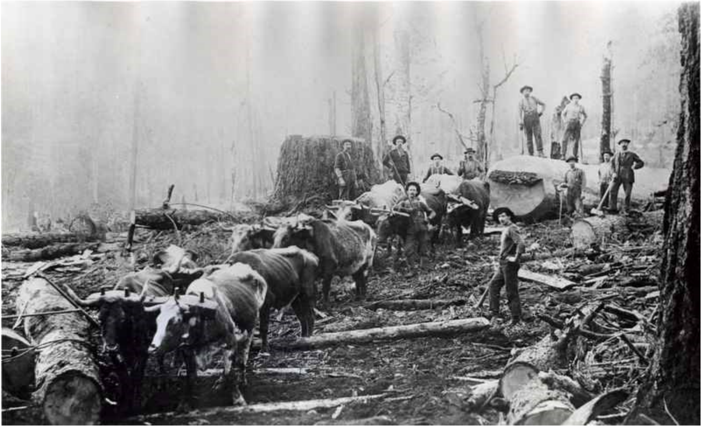
Logging with oxen on the land that would later become Kohler Andre State Park.

“The ox is a most noble animal, patient, thrifty, durable and gentle.” What an elegant, almost reverential description by Peter Burnett, Oregon Trail traveler of the 1850s! Yet humor and practicality quickly enter as he continued, “But, best of all, the mammoth does not run off.”