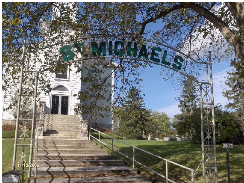
St. Michael's Church viewed through its historic lychgate. This 1860s church and burial ground is found in the town of Mitchell, Sheboygan County. The Hanahan, Bowen and Lavelle families are buried here.