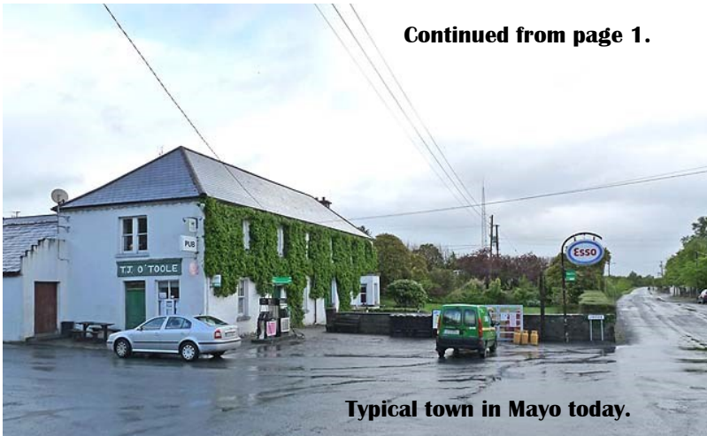
Typical town in Mayo today.

They also let us walk the land and showed us where the original windmill stood. It was a thrill to walk the same land that our Irish ancestors homesteaded. It is just down the road from St. Michael's Church where our Hanahan, Bowen, and Lavelle ancestors were married, baptized and buried.